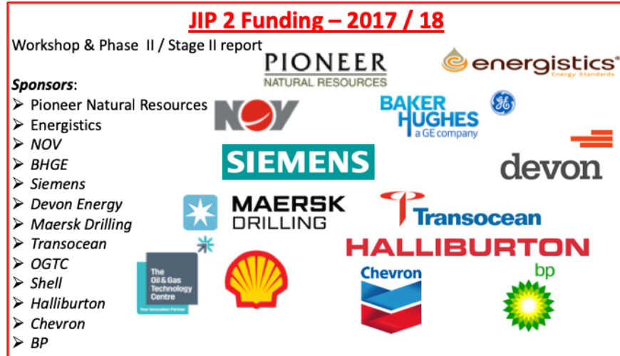
Figure 2: JIP 2 Funders Provided $115,000 based on Returning Funders @ $5,000, Not for Profit Funders @$5,000 and New Funders at $10,000